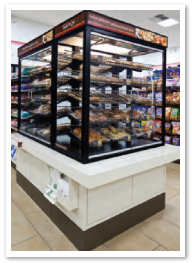
ESS Pastry Case