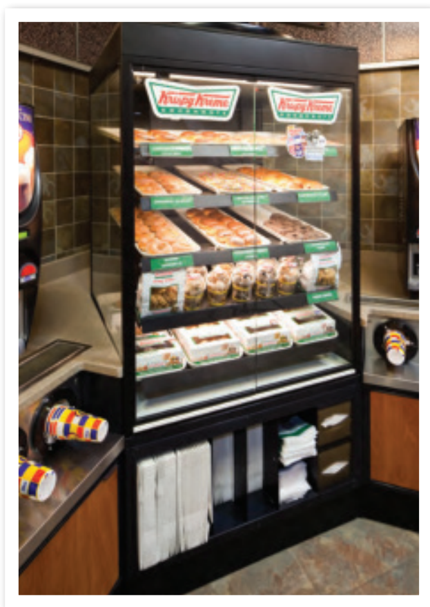
ESL Pastry Case