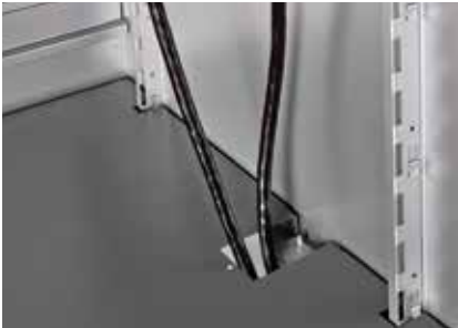
SHELF CUTOUTS No cutting necessary to route cords or fountain syrup lines.