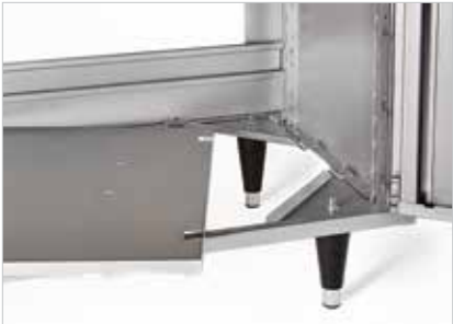
LOOSE BOTTOM Removable for easy access to plumbing and electrical.

At Royston, our cabinets are engineered and built for simple installation, easy maintenance and durable, problem-free performance. As your store evolves, they can be easily reconfigured for new layouts. We’ve helped some customers repurpose the same cabinets for several different store layouts over a 20-year span. That’s the meaning of “built to last.”