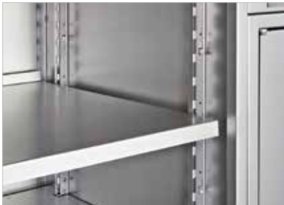
INTERIOR UPRIGHT SYSTEM Handles a variety of modular options.