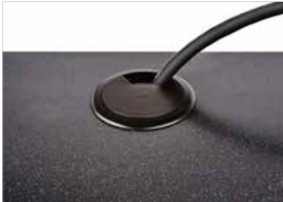
COUNTERTOP PENETRATIONS Run cords or fountain syrup lines.