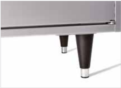
LEG BASE Attractive legs for your cabinet base.