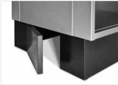
BASE UTILITY CHASE Easily route wiring or plumbing at installation or later.