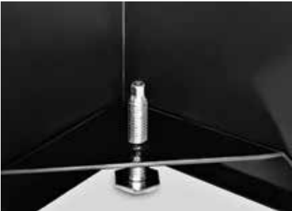
BUILT-IN LEVELER Easy access for leveling.