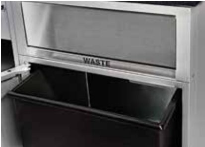
STAINLESS WASTE FLAP Easy to clean. Handles heavy use. Waste cans are sized for the cabinet.