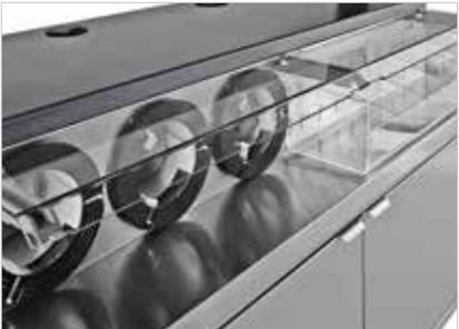
CUP AND CONDIMENT COVER Protects cups and condiments from spills.