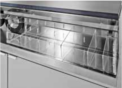
CONDIMENT TRAYS Organize lids, straws and condiments.