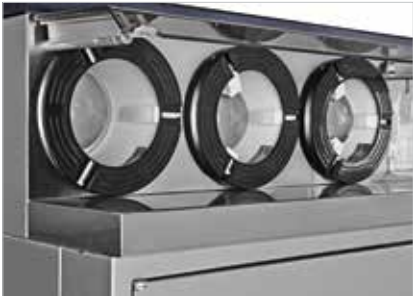
CUP DISPENSER Adjusts for a wide range of cup sizes, without tools or adapters.