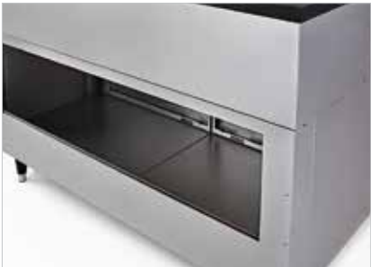
OPEN BACK Easy access to wiring or plumbing.

At Royston, our cabinets are engineered and built for simple installation, easy maintenance and durable, problem-free performance. As your store evolves, they can be easily reconfigured for new layouts. We’ve helped some customers repurpose the same cabinets for several different store layouts over a 20-year span. That’s the meaning of “built to last.”