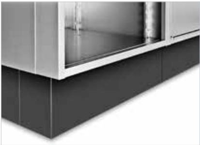
FIXED BASE Covers utilities under the cabinet.