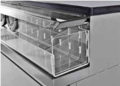
STEP SHELF Keeps countertops organized.