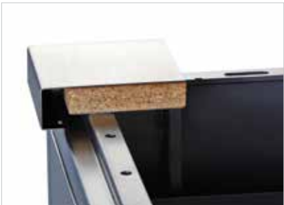
NSF OFFSET EDGE Prevents liquid from running inside the cabinet.