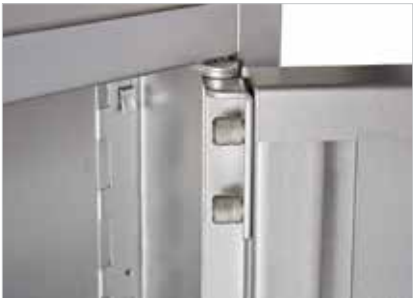
STAINLESS-STEEL PIVOT HINGES No sagging or misaligned doors.