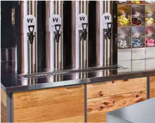
STAINLESS STEEL The ultimate in durable good looks that last and last.

Countertops are key consumer touchpoints and can serve as an unmistakable expression of brand quality. Royston countertops, with their abundance of finishing choices, will make store customers and employees feel right at home.