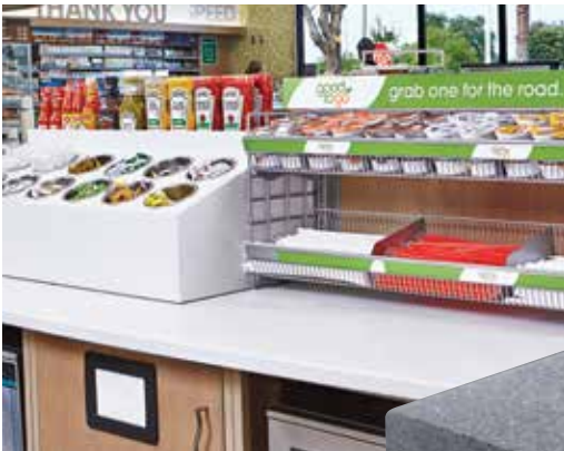
SOLID SURFACE Includes 1/4" plywood substructure with aluminum- backer moisture barrier, to prevent tops from sagging.