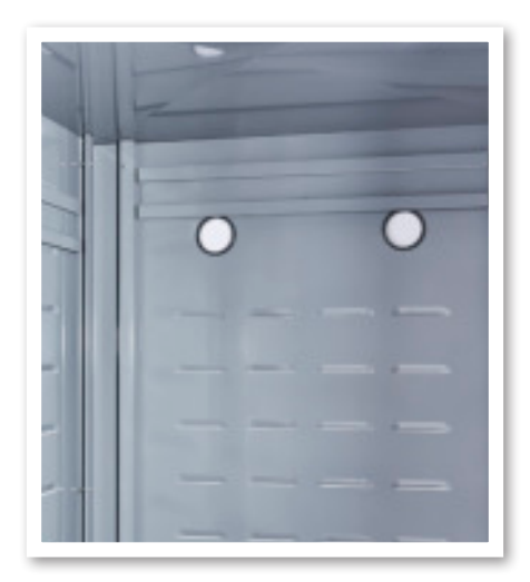
Simple Setup: Pre-punched penetrations for lines