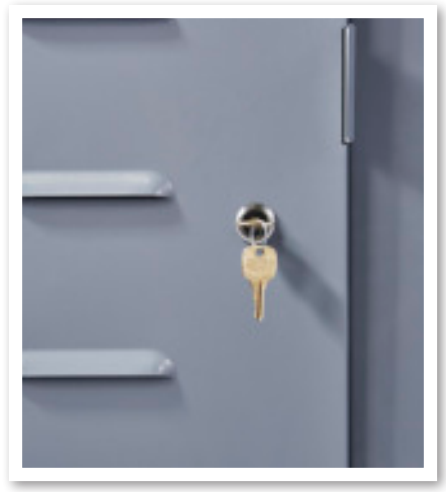
Keep Out: Lockable door