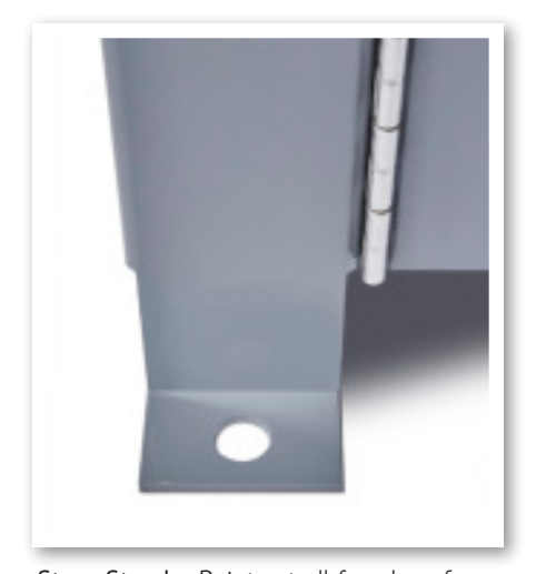
Stays Steady: Points at all four legs for secure installation

Royston LLC One Pickroy Road Jasper, GA 30143 800.334.1766 770.735.3456 770.735.4017<sub>fax</sub> roystonllc.com