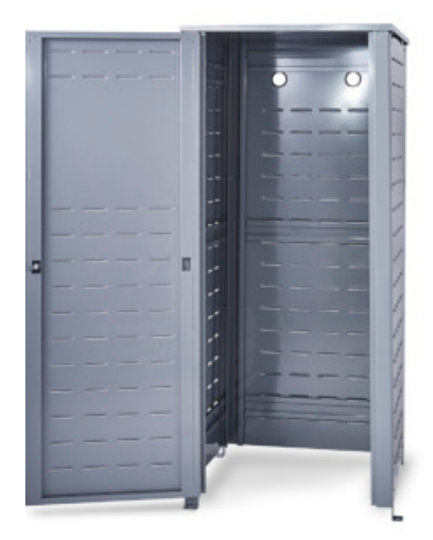
Royston's Outdoor CO2 Cabinet allows you to securely store your bulk CO2 tanks