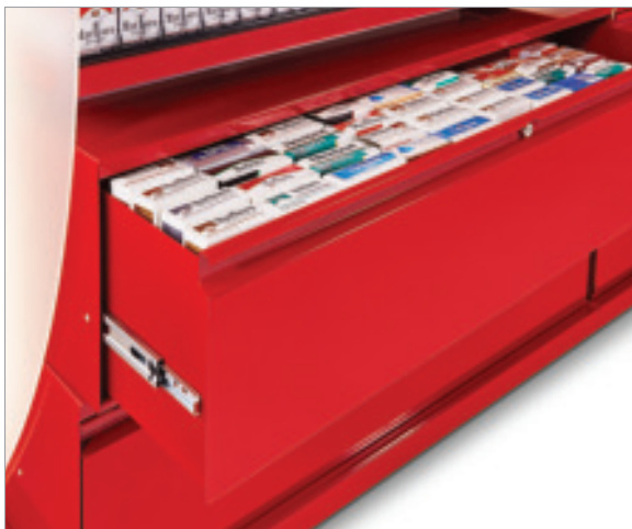
Locking metal drawers provide secure carton storage.

Our standard fixtures incorporate the features that give you merchandising options for a comprehensive tobacco program; you can modify a unit as inventory changes to suit customer tastes. Floor and wall mounted units give you flexibility to fit the needs of your space.