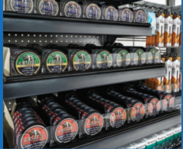
Pull out shelving simplifies stocking.