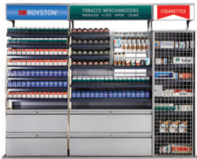
LED lit headers showcase the category.

Solid, peg and wire backs let you merchandise any combination of standard cigarettes, cigars, E-cigarettes and smokeless tobacco products. You can reconfigure the unit to appeal to changing tastes or new markets or to merchandise new products. Royston tobacco merchandisers give you the flexibility to grow your program. And they're Altria approved to make a difference to your bottom line.