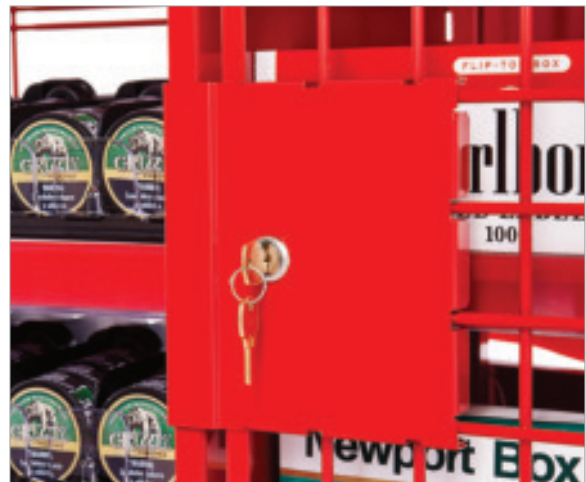
Storage cabinet for secure merchandising of E-cigs, liquor or for extra storage. Optional grid, solid panel or Lexan door.