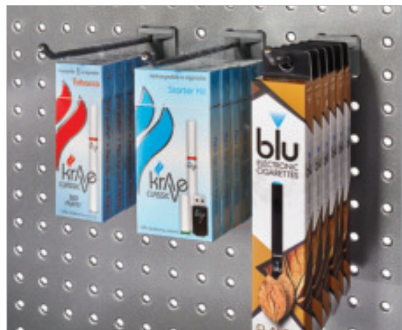
Optional backs make merchandisers more versatile.