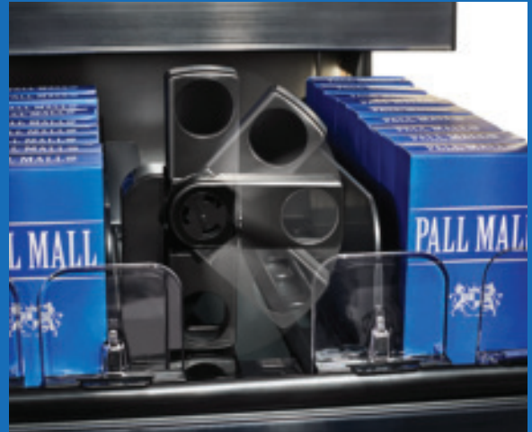
3-position product pushers and variable channel width adjustment let you update your tobacco program.