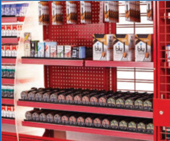
Optional acrylic blade dividers are edge lit.