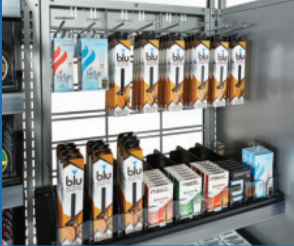
Sectional upright allows maximum flexibility.