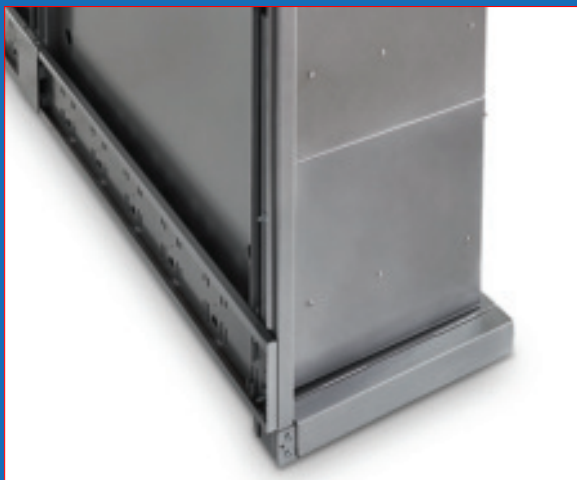
Floor and wall mounting lets you make the most of your space.