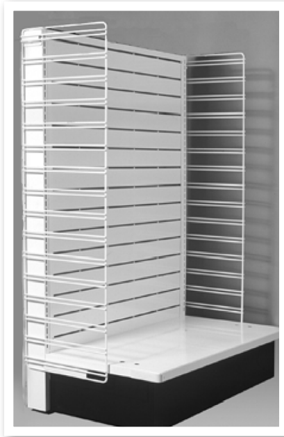
Slatwall shown is optional